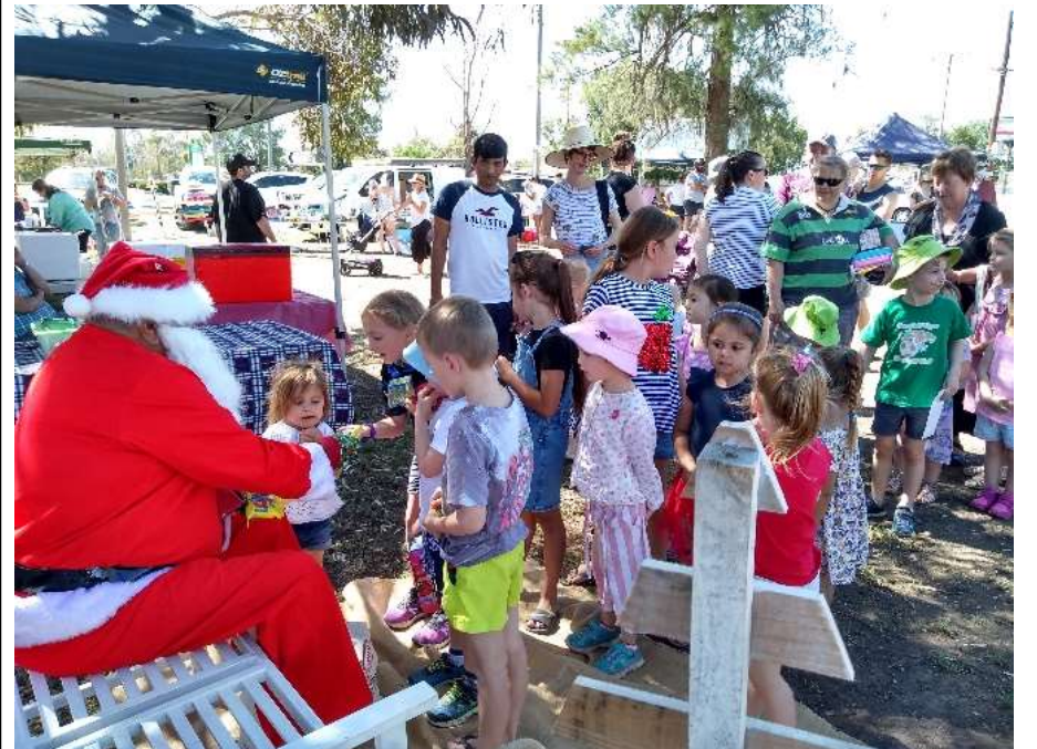
The Walgett Show was cancelled so Rajah the Clown was not seen in 2020.