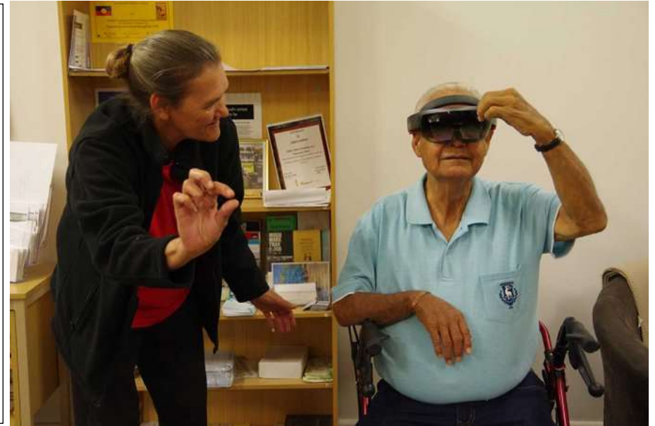
DEG Elders – dhirrabuu giirr (deadly)!