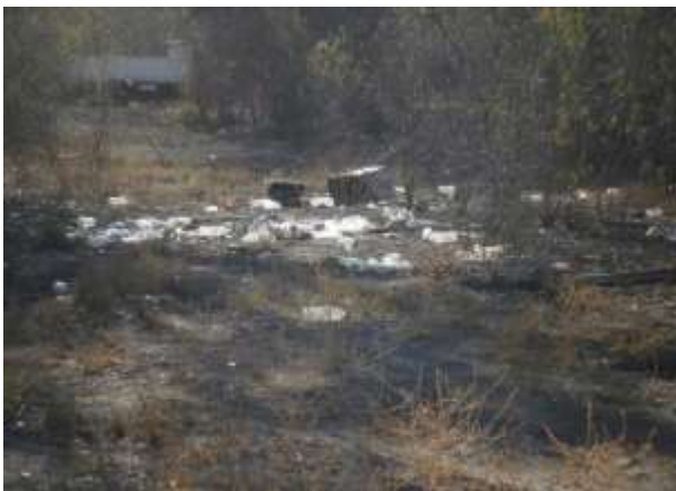
Left: Montkeila Bend before DEG removed rubbish for the walking tracks project, Nov '14. Right: The June 2015 launch of Walgett's "Caring for Country" Walking Tracks and 16 interpretive signs that offer Aboriginal cultural information to visitors.